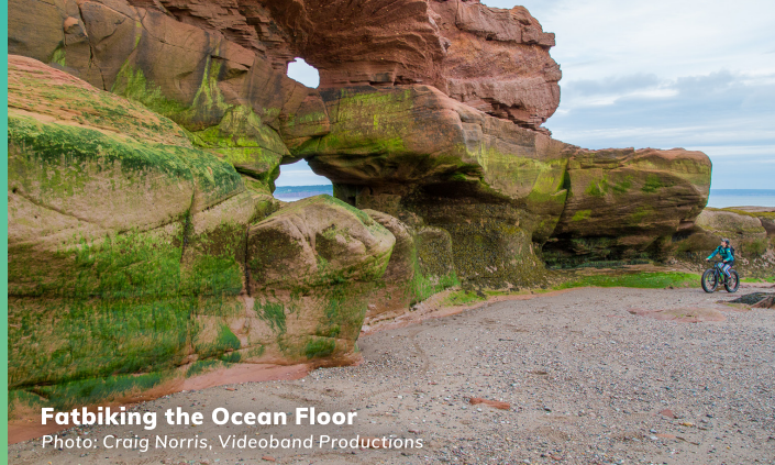
Fatbiking the Ocean Floor