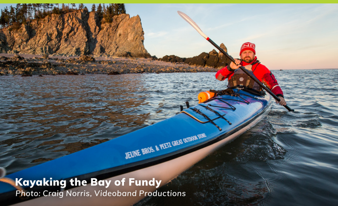
Kayaking the Bay of Fundy

Amazing Places are made possible through the generous support of our partners